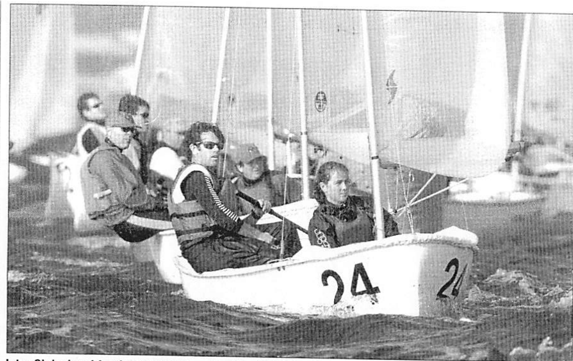
Inter Clubs head for the windward mark at the 2001 Frostbite Association's national regatta.